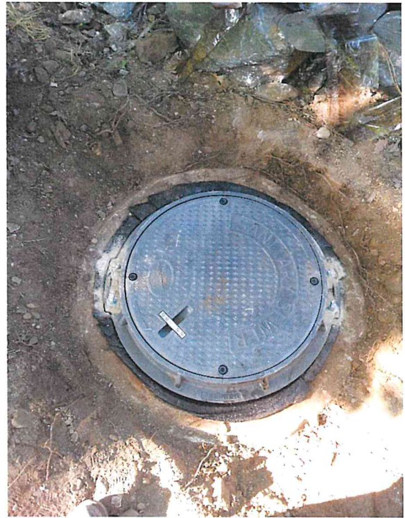
Manhole 12242 with rock removed