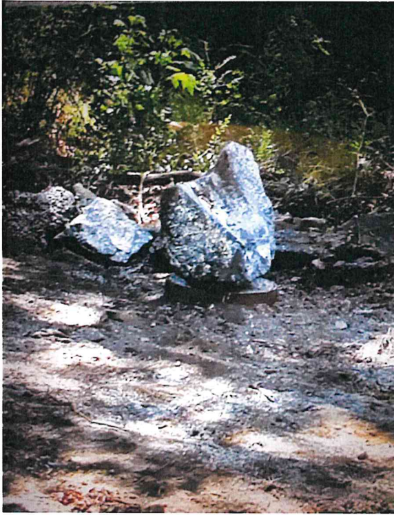
Manhole 12242 with rock